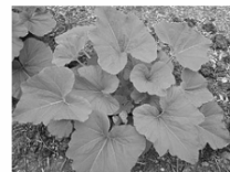
One courgette plant produces around 16 fruits